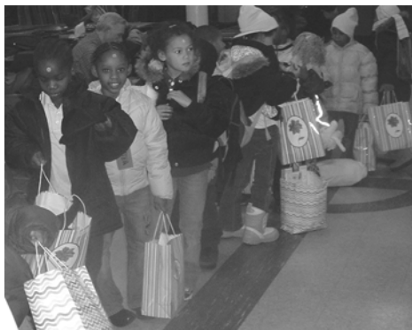
After School Kids with Santa's Presents