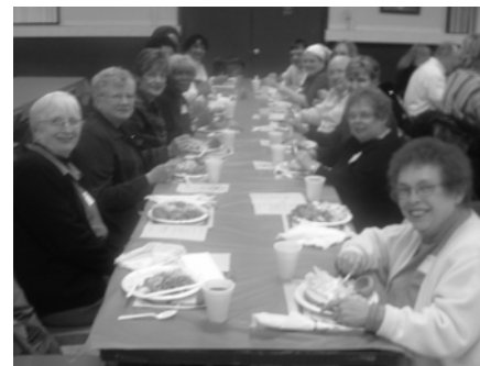
Some Soup for the Soul volunteers