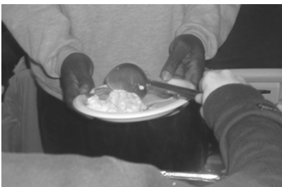
Volunteers Serve Christmas Breakfast to Our Homeless Friends