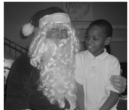
Santa Claus came to two events