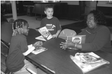
Good Books Make Kids Smile!

My prayers for all of you are filled with joy because of your partnership in the Reign of God from the first day you heard about it. Joy springs from my confidence that God who began a good work in you will progress until it's finished , working night and day until our Savior returns. (Philippians 1:4-6)