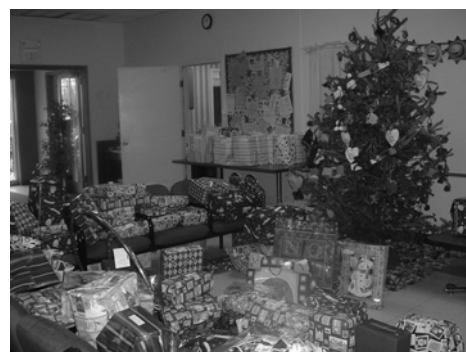
Presents Ready for Our Center Children