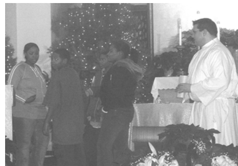
Teens Pray with Seminarian at Lock-In