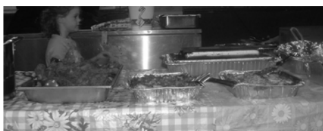
Families Shared Food at the Potluck

Christmas began December 3 rd at our first of nine Holiday events in December, the Tree Decorating Party . Many families came to sing carols, learn about the Advent Wreath, and eat cookies.