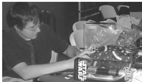
St. Ignatius High School Student Wraps Gifts to Hand Out During Santa's Visit