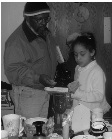
Volunteer Helps at Children's Boutique