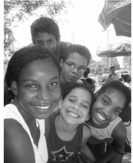
Summer campers on a field trip