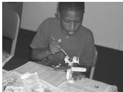
Campers learned new crafts

One very special event was Café YTA (Young Teens Alliance). The Teens made and served lunches to customers who came to eat at the Center and for customers who came to get lunch "to go." The common area on the first floor was transformed into a chic restaurant and the students were transformed into hosts, hostesses, servers, bussing people, and cooks.