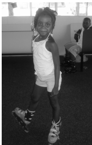
Skating was a favorite!

St. Malachi Center stayed active during summer vacation, with engaging activities for all ages.