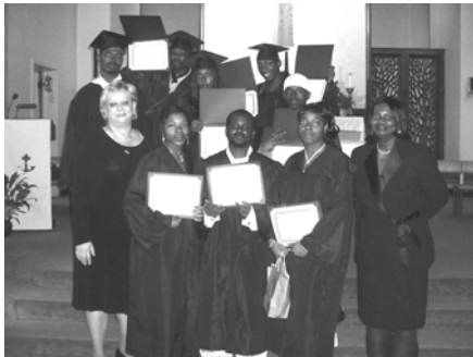
Proud Steps to Success graduates