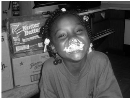
Having some fun at St. Malachi Center