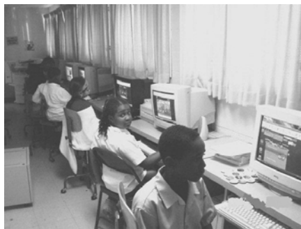
Computer Lab time

many neighborhood children today as it did for Ronald. The staff design activities that focus on the program's philosophy and goals: to provide children a nurturing, safe, and structured environment; to help to develop appropriate skills in developing peer relationships; and to support the development of children and youth by providing academic assistance, cultural