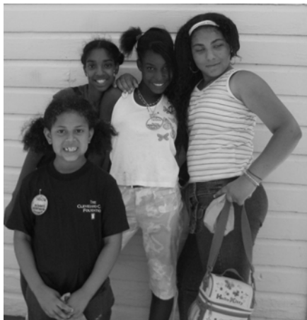
Friendships being built