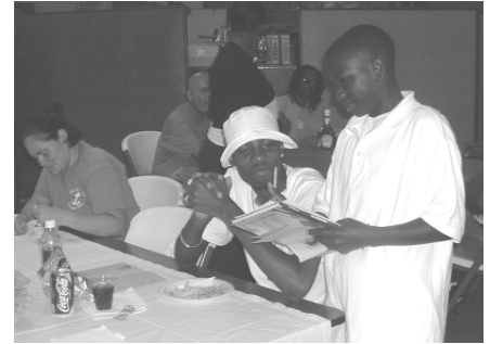
A GREAT time at YTA Café!