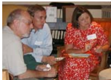
Work behind the scenes to provide technical support or help out on a fundraising committee.