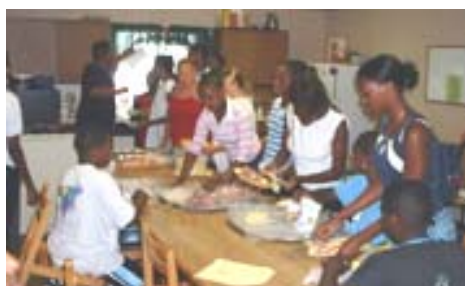
YTA prepare meals for annual YTA Cafe

Saturday 10/4/03 9:30-3 Scarecrow Building (bring clothes) 10-6 Dahlia Society Show 11-3 Meet Alcapas Sunday 10/5/03 10-5 Dahlia Society Show 11-1 Petting Zoo 12-3 Scarecrow Building (bring clothes) Saturday 10/11/03 11-1 Kids make a craft 11-2:30 Adopt a pet from APL 12 Animal Guys Sunday 10/12/03 11-1 Kids make a craft 12-3 Adopt a pet from APL