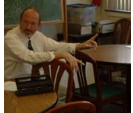
Share your experiences and knowledge by speaking or leading an activity for one of our groups.