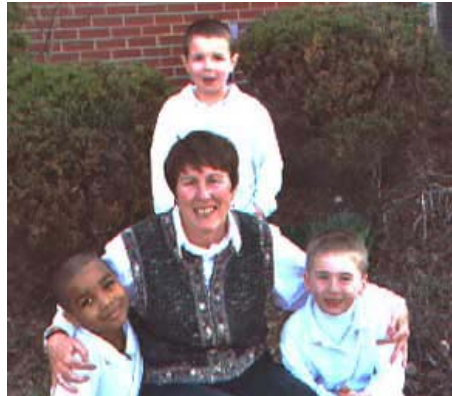
Be a positive role model for a child by serving as a Reading Buddy, tutor, or mentor.